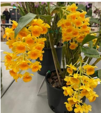
Den. densiflorum