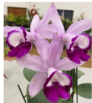
C. Orlata 'Crown Fox' Jenny do