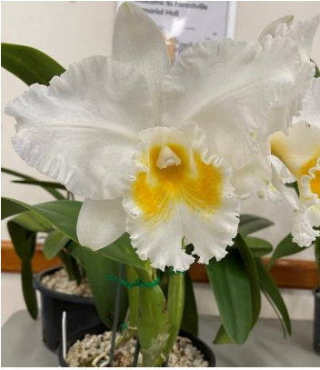
C. Lyn Spencer 'Pearl' G & A Cushway