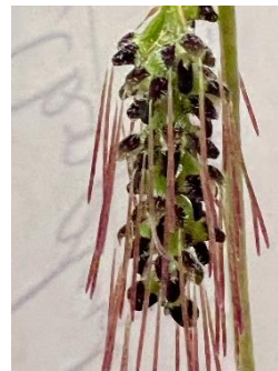
Bulb. lemniscatoides