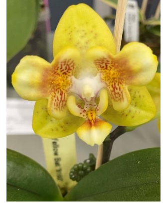
Phal. Anmio Yellow Bat Bailey Wong