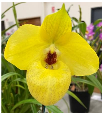
Paph. Yellow Magic L & G Bromley