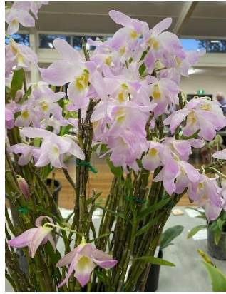
Den. regium Dora Law