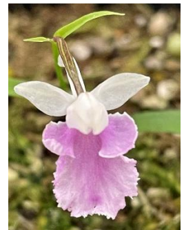
Ponerorchis graminifolia